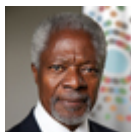
Kofi Annan U.N. Secretary-General, 1997 - 2006.

"When women thrive, all of society benefits, and succeeding generations are given a better start in life."